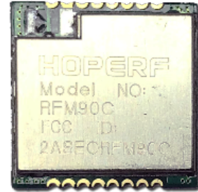
Picture1: RFM90CW Appearance

RFM90CW sub-GHz radio transceivers are ideal for long range wireless applications. It is designed for long battery life with just 8mA of active receive current consumption. It can transmit up to +22dBm with highly efficient integrated power amplifiers. These devices support LoRa® modulation for LPWAN use cases and (G)FSK modulation for legacy use cases. The devices are highly configurable to meet different application requirements utilizing the global LoRaWAN™ standard or proprietary protocols. The devices are designed to comply with the physical layer requirements of the LoRaWAN™ specification released by the LoRa Alliance™. The radio is suitable for systems targeting compliance with radio regulations including but not limited to ETSI EN 300 220, FCC CFR 47 Part 15, China regulatory requirements and the Japanese ARIB T-108. Continuous frequency coverage from 150 MHz to 960 MHz allows the support of all major sub-GHz ISM bands around the world.